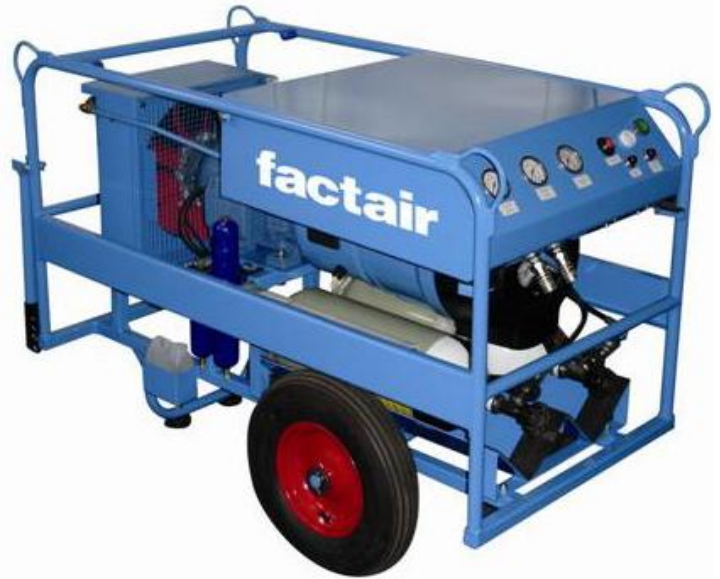
Above - BA400E which incorporates integrated alarm and fail safe reserve.

The BA400E also has a fully integrated automatic fail-safe emergency air back up and alarm system. In the event a drop in the primary air pressure an audible sounder will be activated and the air will continue be supplied from two 9-litre 200 bar (optional 300 bar also available) cylinders. The control panel has a status indicator which in the event of a failure of the primary air will automatically change from green to red and an LED light activated. If the air pressure in the HP cylinders drops below 140 bar this will also activate the alarm and an LED light on the control panel.